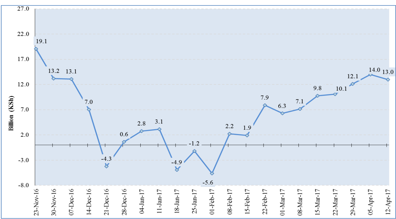
CHART B: COMMERCIAL BANKS EXCESS RESERVES